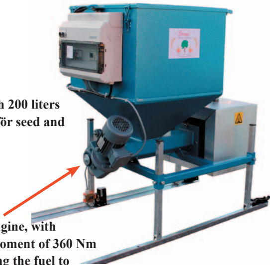
Powerful engine, with a turning moment of 360 Nm for conveying the fuel to the incinerator.